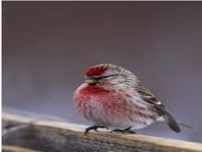
Image of common winter birds for teachers use